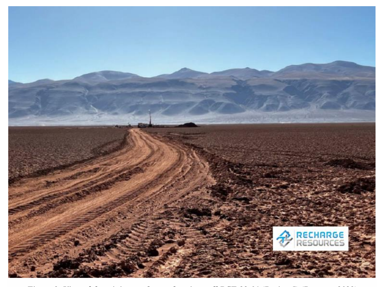
Figure 3: View of the mining road to exploration well PCT-22-01 (Pocitos I) (Panopus 2023)

The NI 43-101 technical report titled "NI 43-101 Technical Report Pocitos I and II, Salta Province, Argentina" and dated December 18<sup>th</sup>, 2023 will be filed on SEDAR+ under the Company's profile at <a href="https://www.sedarplus.ca">www.sedarplus.ca</a> and will also be available on the Company's website.