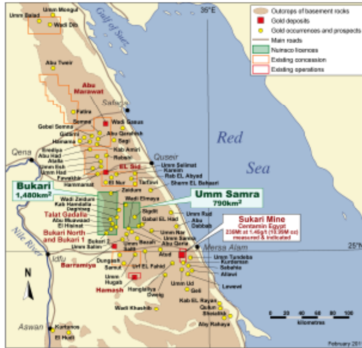
Nuinsco Resources Limited Bukari and Umm Samra Concessions Egypt Compilation Map

varying from estimates, changes in world copper and/or gold markets, changes in equity markets, uncertainties relating to the availability and costs of financing needed in the future, equipment failure, unexpected geological conditions, imprecision in resource estimates, success of future development initiatives, competition, operating performance of facilities, environmental and safety risks, delays in obtaining or failure to obtain tenure to properties and/or necessary permits and approvals from government authorities in Egypt and elsewhere, and other development and operating risks. Any forward-looking statement speaks only as of the date on which it is made and, except as may be required by applicable securities laws, Nuinsco disclaims any intent or obligation to update any forward-looking statement, whether as a result of new information, future events or results or otherwise. Although Nuinsco believes that the assumptions inherent in the forward-looking statements are reasonable, forward-looking statements are not guarantees of future performance and accordingly undue reliance should not be put on such statements due to the inherent uncertainty therein.