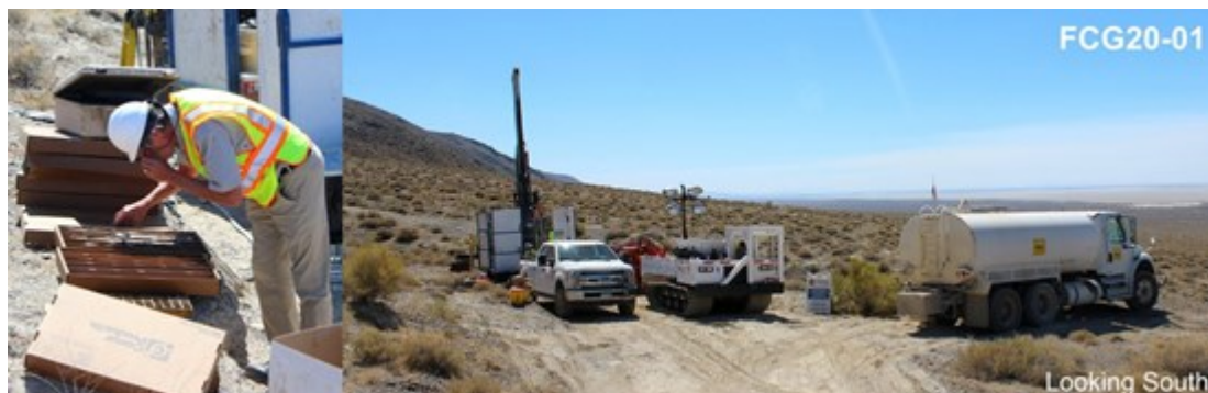
Figure 3: Fondaway Canyon Pediment Target Area drill hole FCG20-01 looking South

One drill hole is planned to test the median point between the two historic gold intercepts to characterize the geological setting and gold mineralization in order to determine orientation and design a follow-up drill program.