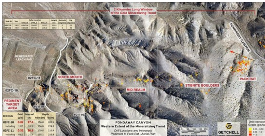
Figure 2: Fondaway Canyon West Area Plan Map showing main shear veins, drill traces and gold intercepts

To view an enhanced version of Figure 2, please visit: